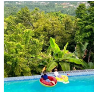
JAMAICAN VACATION FOR UP TO 18

Can't attend, but want to bid on Live Auction items? Proxy Tickets are available for $75 - click the link to learn more!