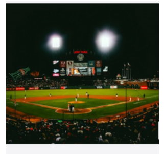
UVA VS. MIAMI FIRST PITCH & TICKETS